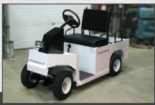
Shown with four wheels and optional steering wheel.