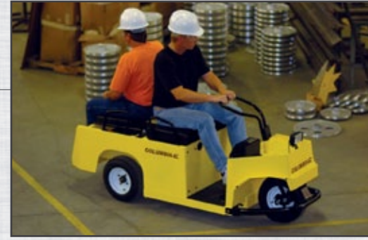
Shown with seat configured in two passenger mode.